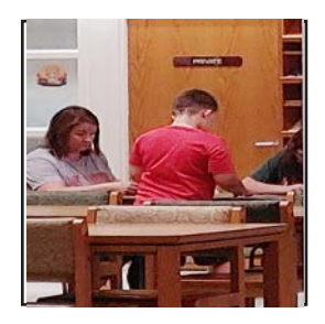
The library is a good place to relax after school, before practice, and between games.