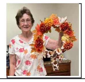
The library has so much for everyone. Adults can learn a new craft.