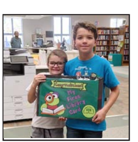
September was Library Card Sign-up month. If you don't have your library card, it's never too late. Stop by and sign up.